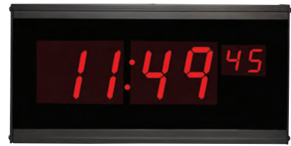
Surface Mount 6 1/8" x 12" x 3 1/2"d