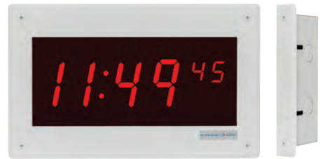
Flush Mount Front: 8 3/8"h x 13 3/8"w Enclosure: 7 3/8"h x 12 3/8"w x 3 3/8"d