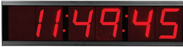
6 1/8" x 24" x 3 1/2"d

These clocks are 6 digit multi-function clocks/timers which can be used as an up or down counting elapsed timer with an optional Code Blue trigger.