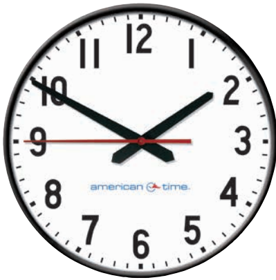
Dial Style 91

For Dukane Wired Synchronous 60 th Minute Correction by American Time