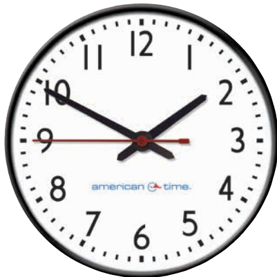
Dial Style 22

Our durable, economical replacements for Dukane are manufactured by a highly trained and experienced production staff and backed by a Two Year Warranty .