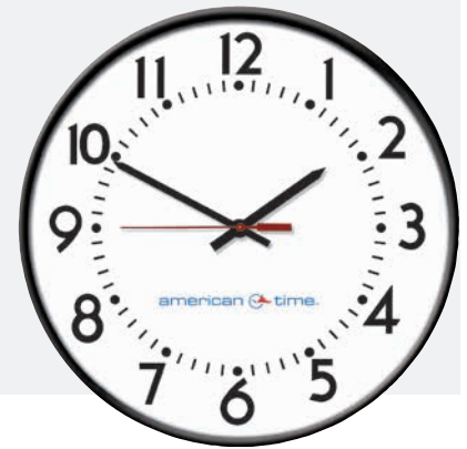
Dial Style 04