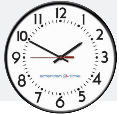
Dial Style 04