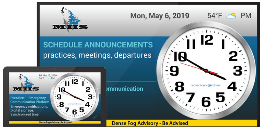
EverAlert 22" Dynamic Display