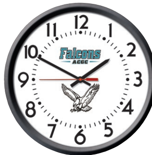
Free Personalized Dials

The PoE Clock Series from American Time offers a selection of clocks to match a variety of applications. These clocks have durable cases and crystals, as well as easy viewing faces.