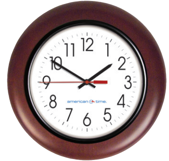
Mahogany 37 dial style