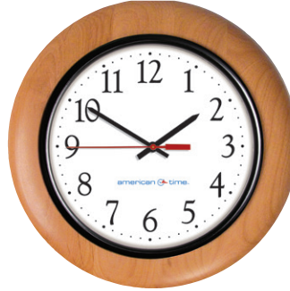
Light Oak 55 dial style