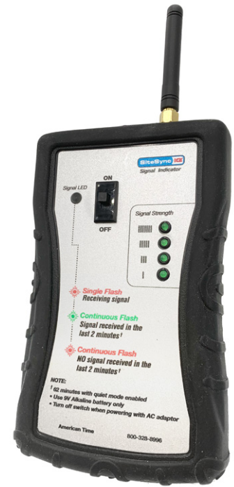
Part # H004292

The four Signal Strength LEDs are used to represent the RSSI (Received Signal Strength Indication) value at the location of last reception. These LEDs will remain on for 20 seconds after the last page received.