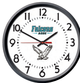
Free Personalized Dials